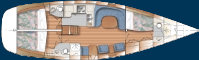
Optional Twin Aft Cabin Interior

All three interior layouts are available with the following options on the Starboard side of the Main Cabin: