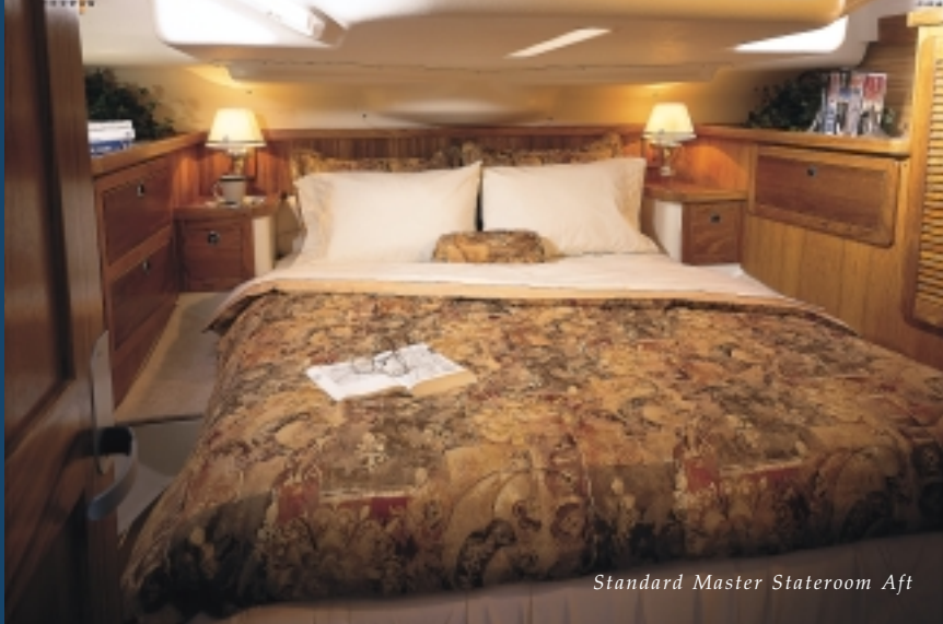
Standard Master Stateroom Aft

There comes a point in a sailor's life where time and ability excite the desire to reach for more and more distant horizons. There is also a point when experience and knowledge will define the vessel capable of reaching distant horizons.