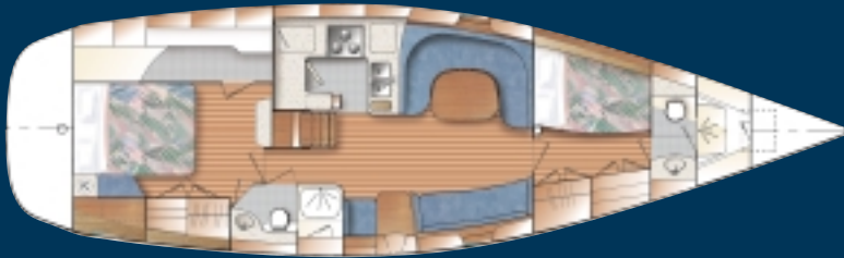
Optional Two-Stateroom Interior with workbench compartment